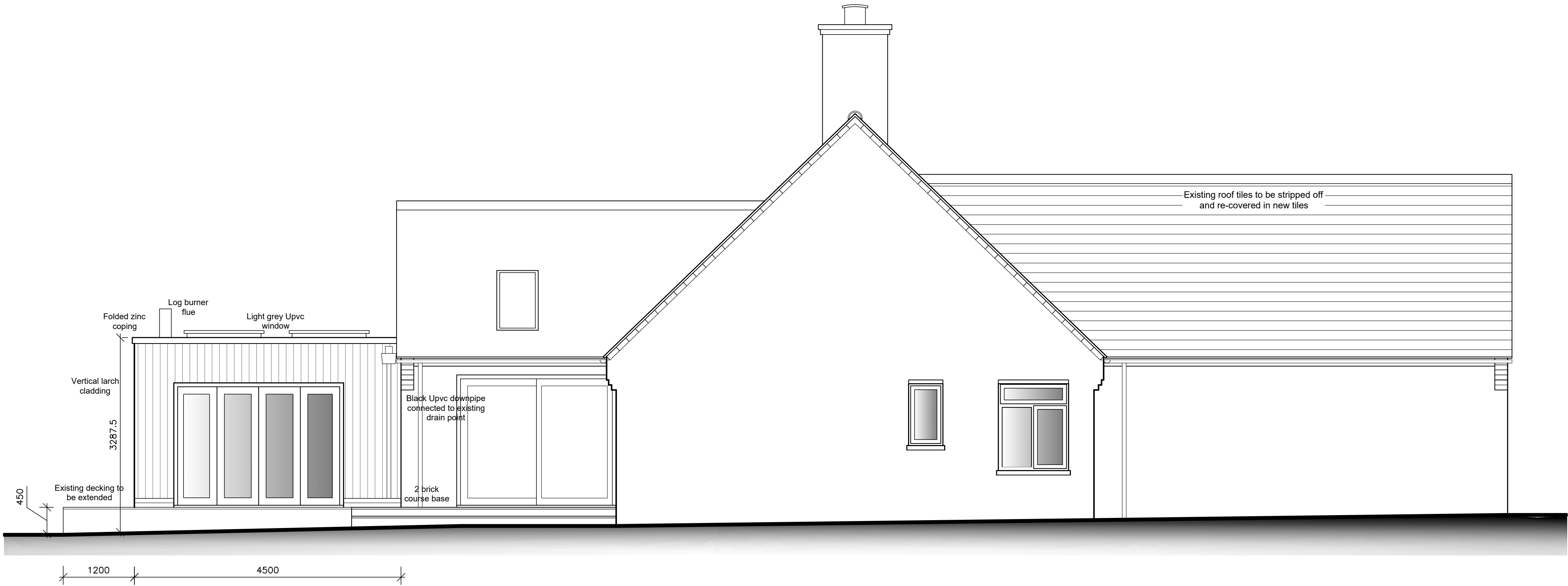
PROPOSED SIDE (EAST) ELEVATION SCALE 1:50